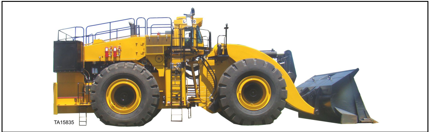
Typical P&H wheel loader

Braking is accomplished by three separate systems. The primary braking system utilizes characteristics of the drive motors, causing "dynamic braking". The secondary system, the service brake, is an air-operated disc brake attached to each motor shaft. The third system, the parking brake, is a spring-applied, air release brake.